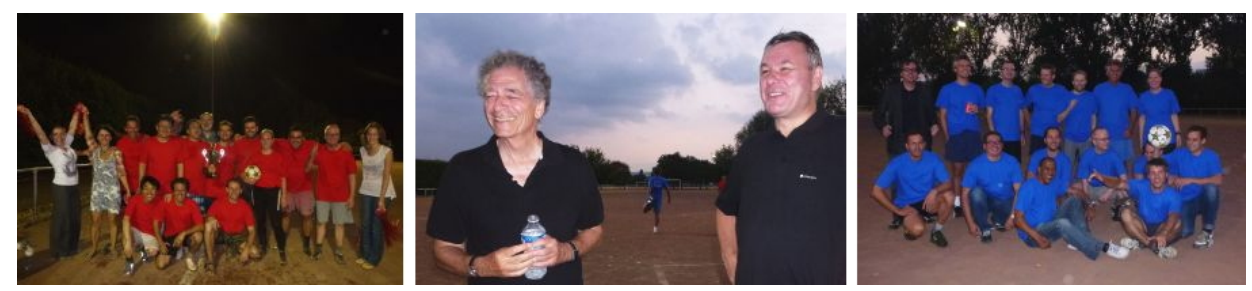
Football match, ESRS Congress 2012, Paris